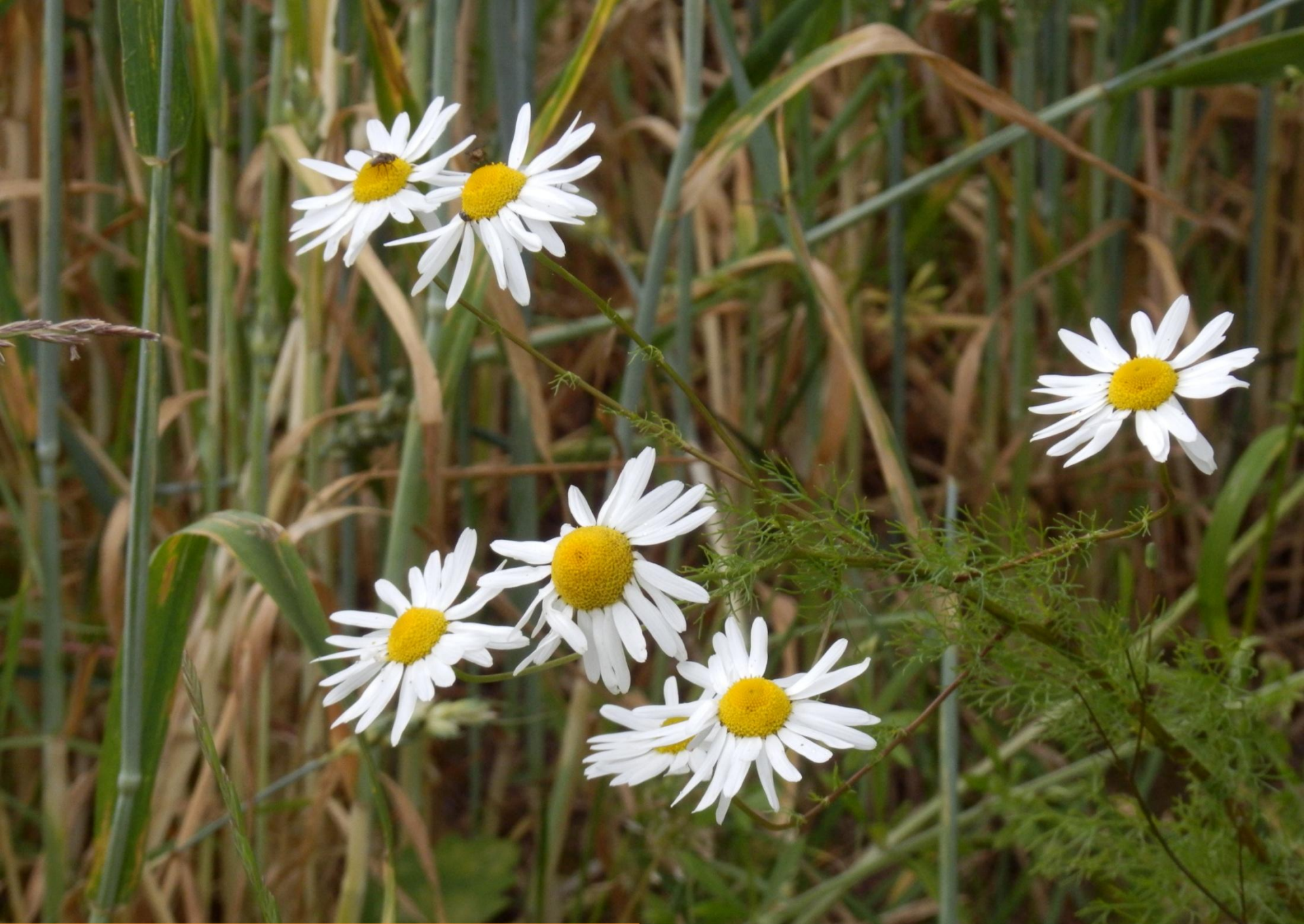
Scented mayweed in Back Lane