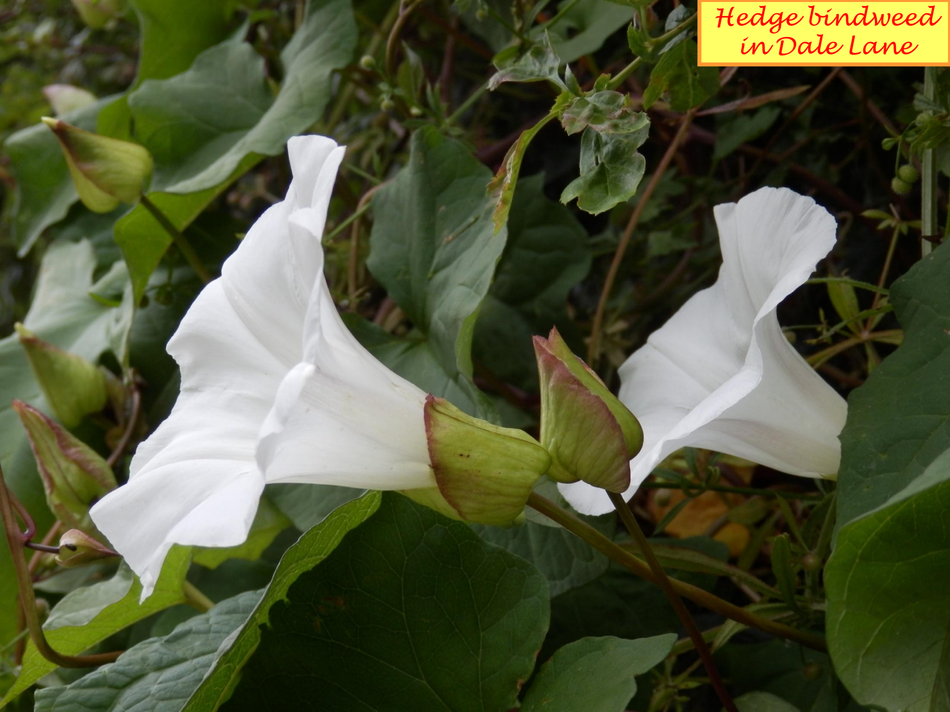
Hedge bindweed in Dale Lane