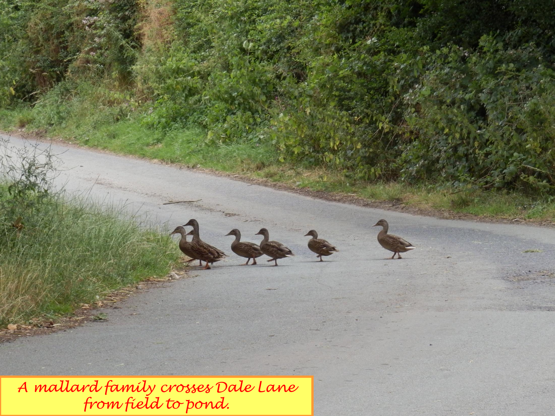
A mallard family crosses Dale Lane from field to pond.