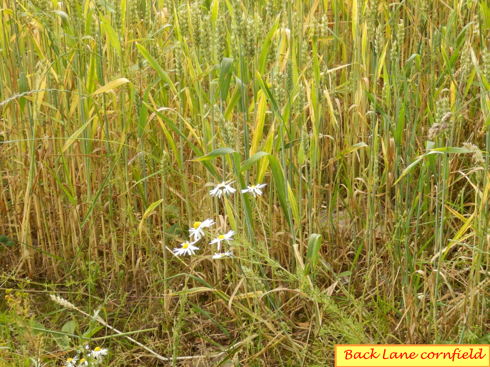
Back Lane cornfield