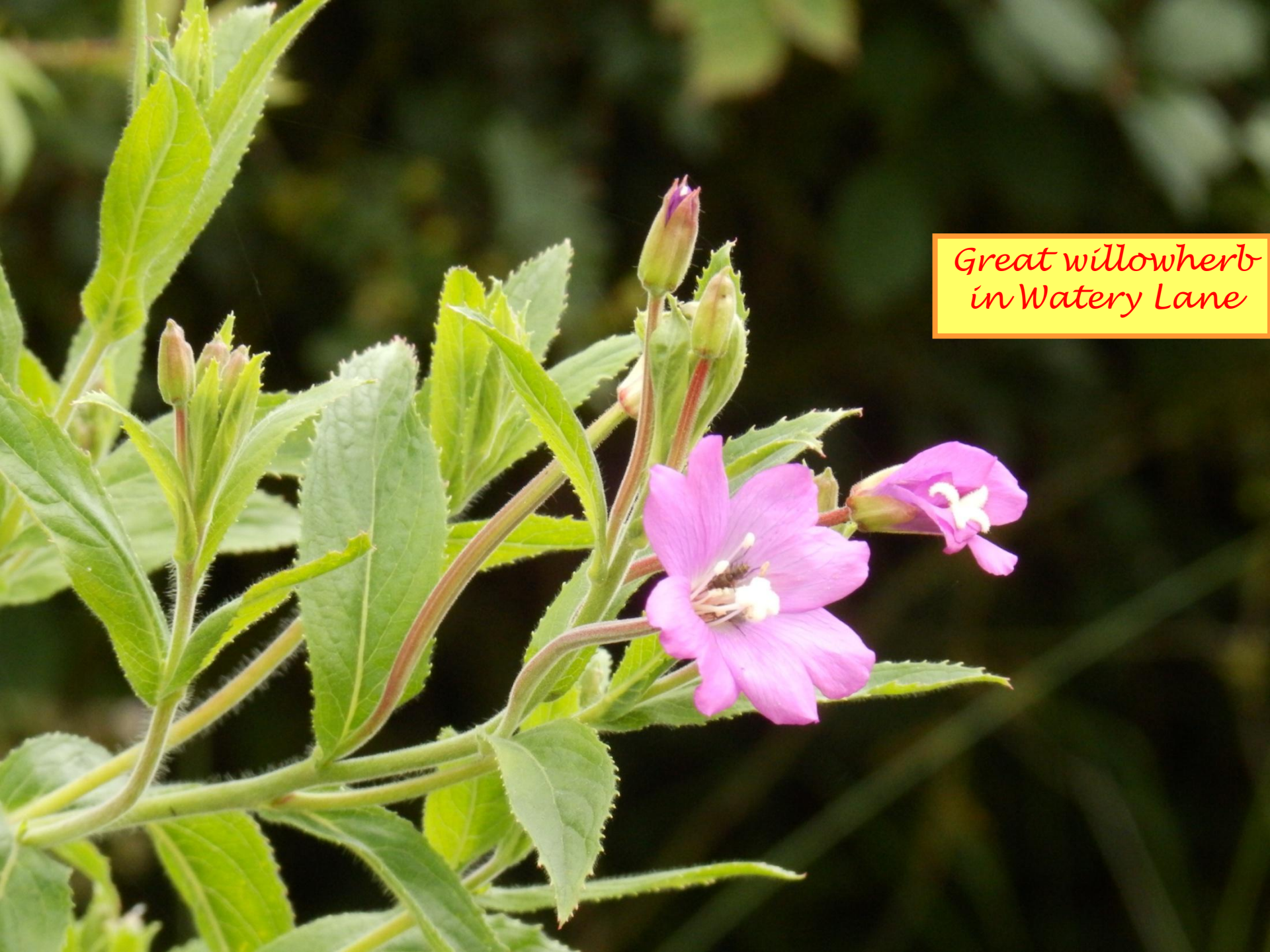
Great willowherb in Watery Lane