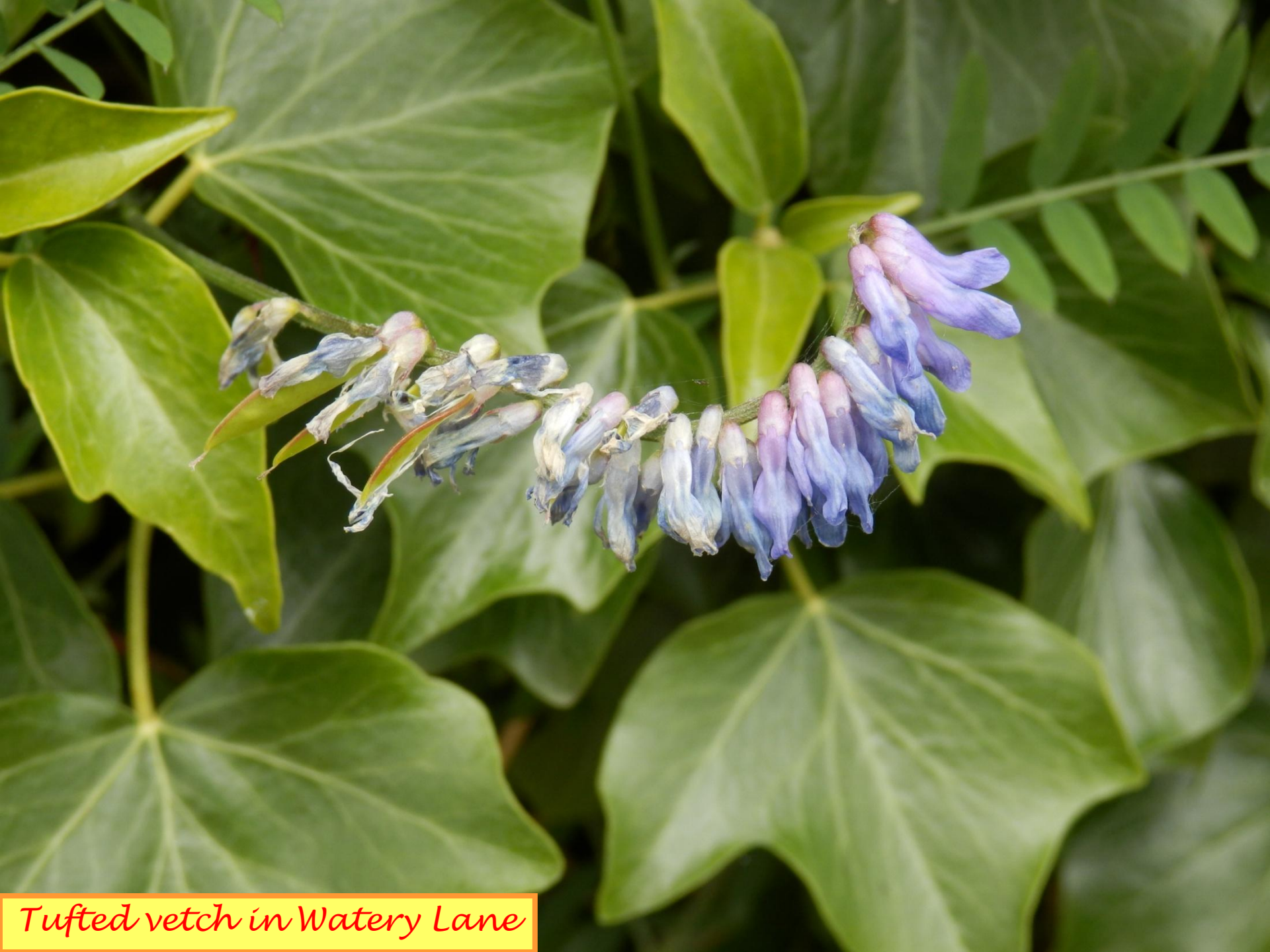
Tufted vetch in Watery Lane