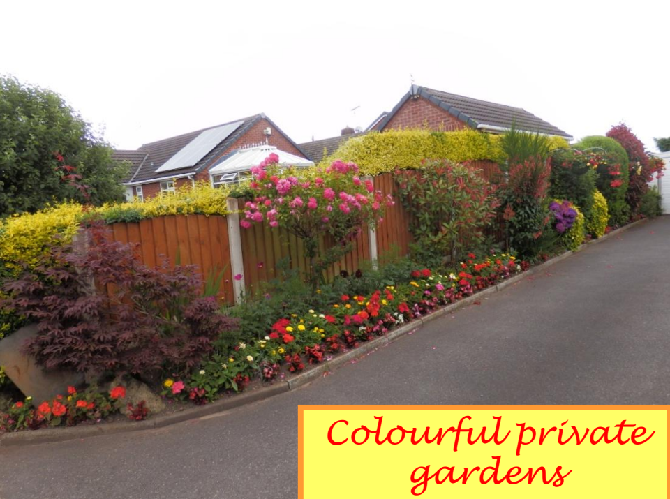
Colourful private gardens