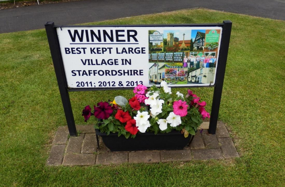
Thriving and colourful plants in beds and borders