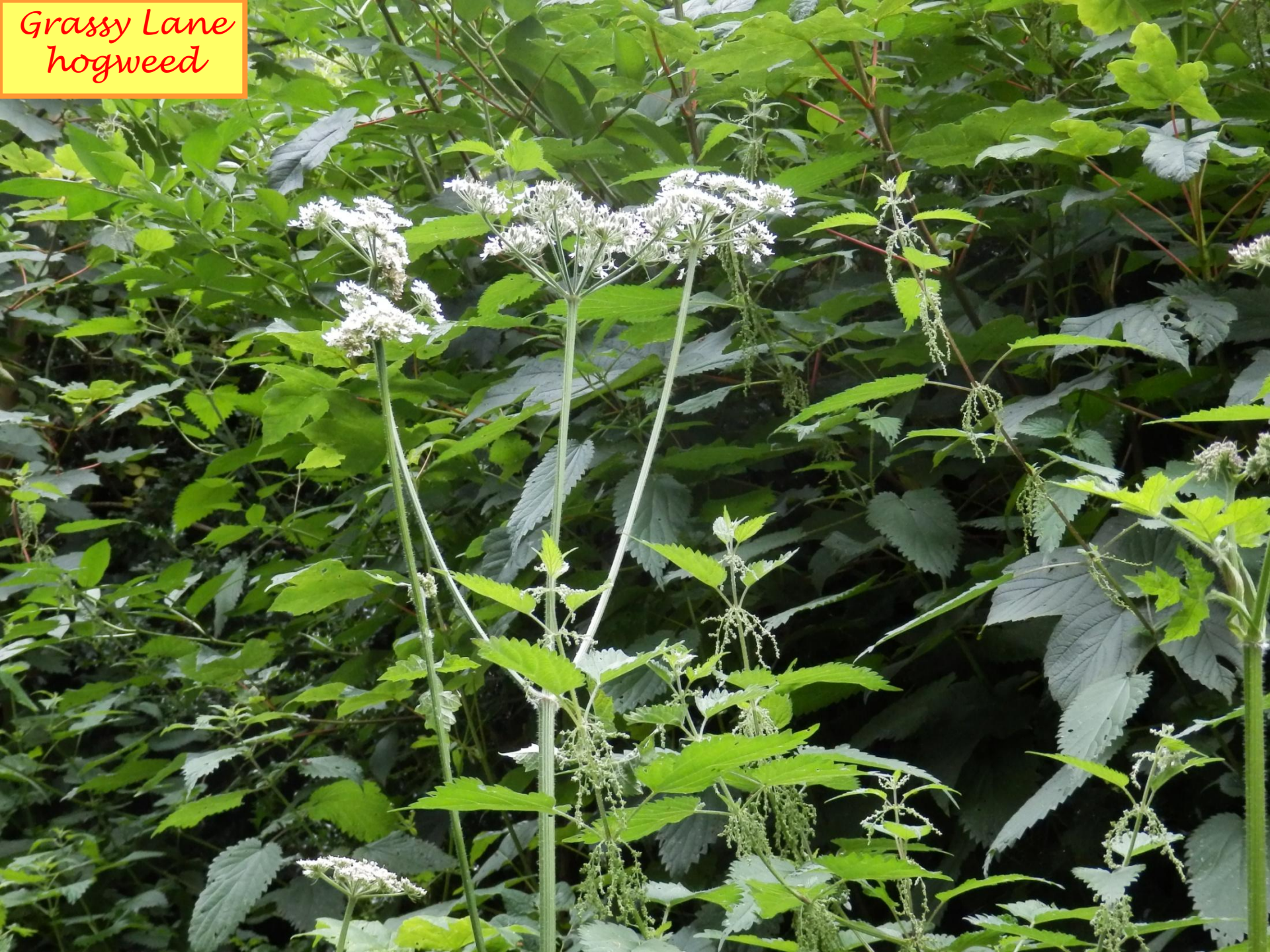
Grassy Lane hogweed