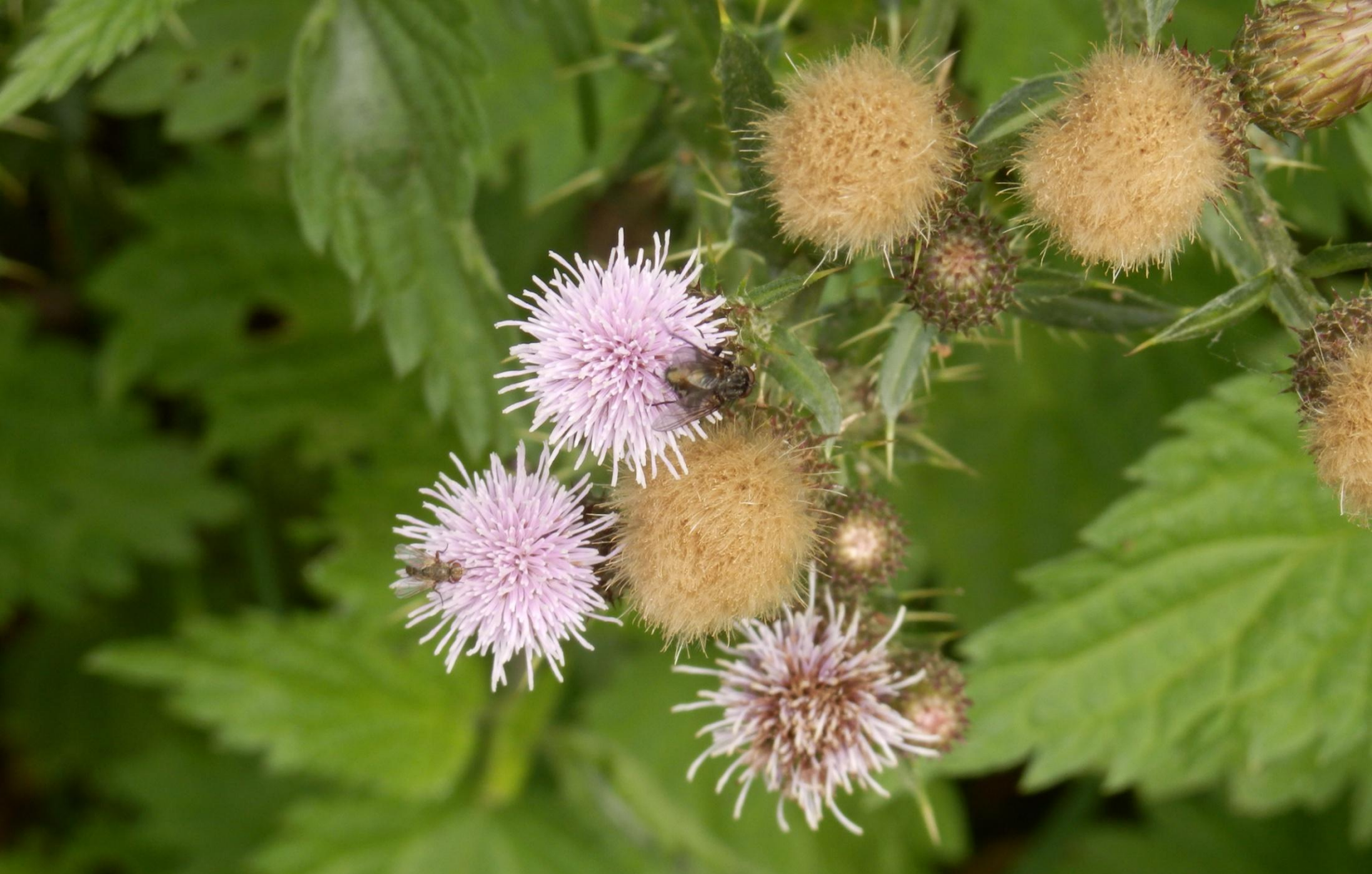
Thistles in Dale Lane