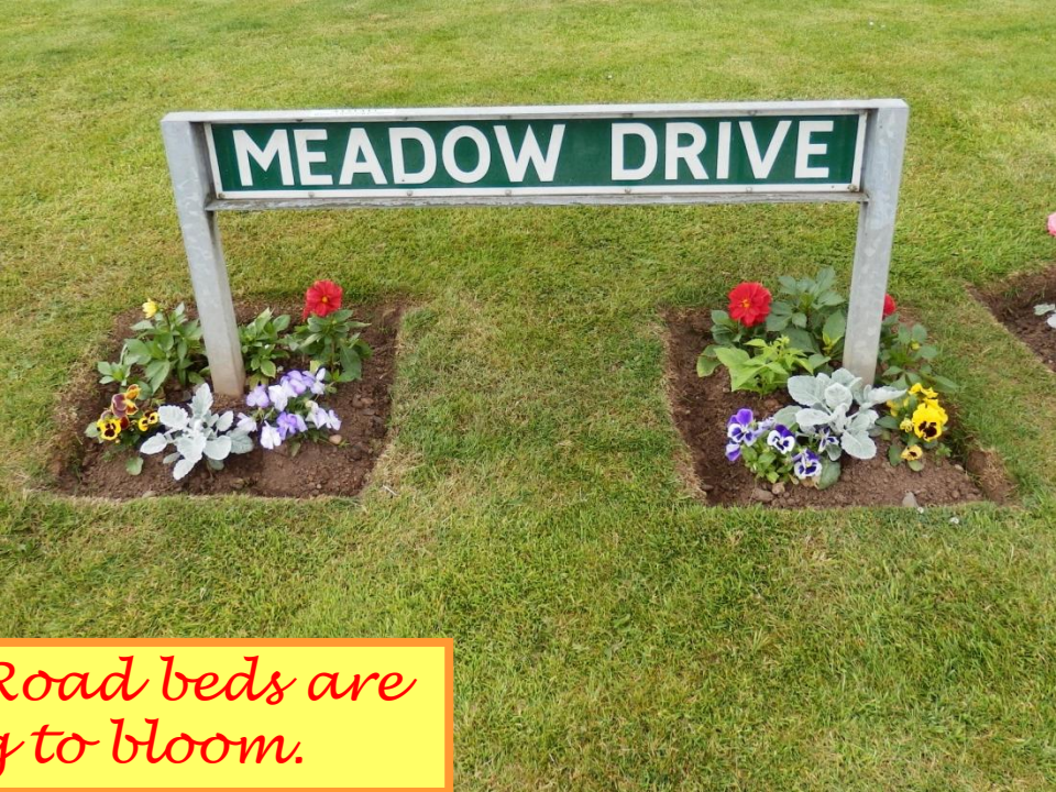
The Newport Road beds are beginning to bloom.