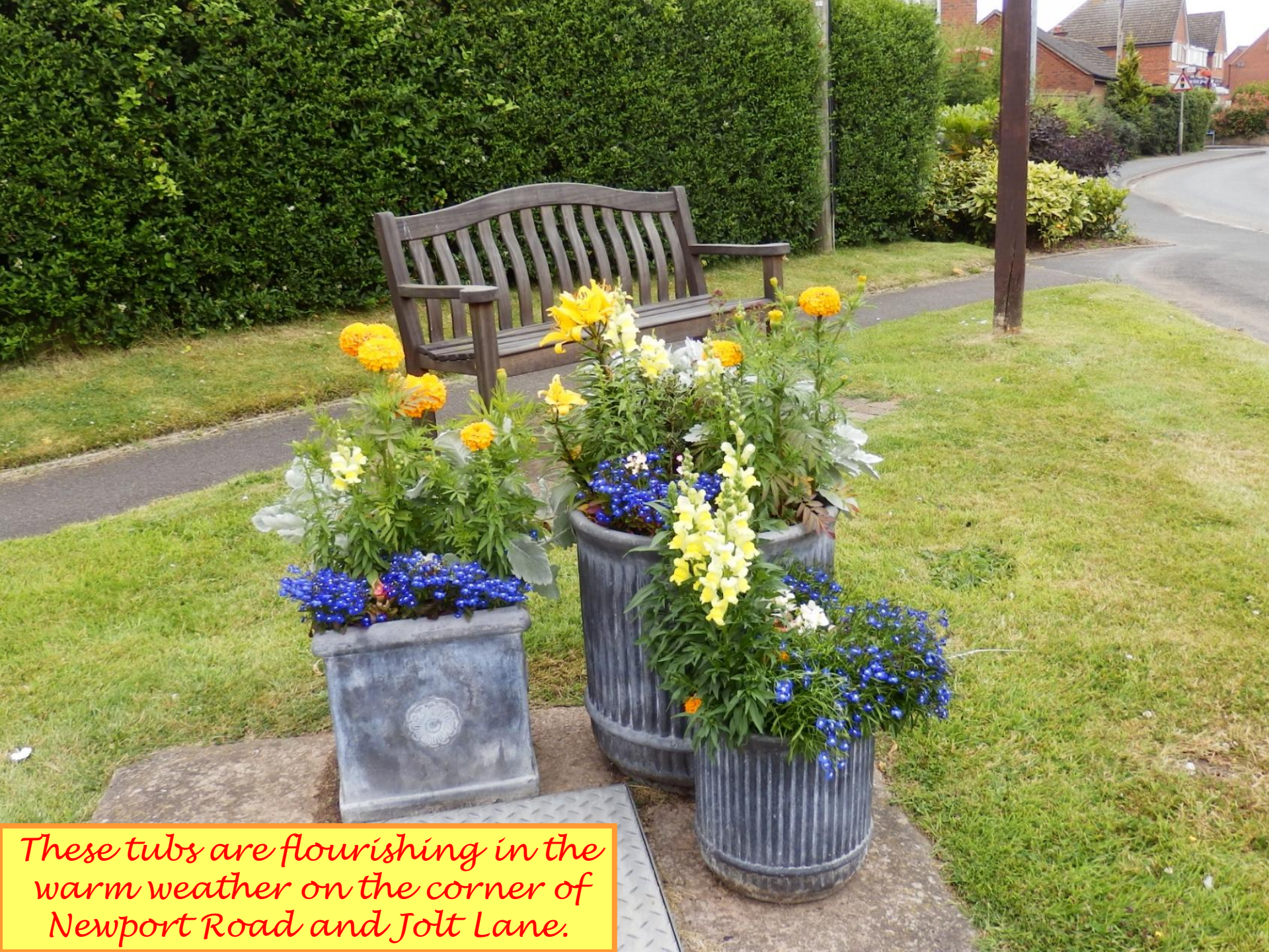
These tubs are flourishing in the warm weather on the corner of Newport Road and Jolt Lane.