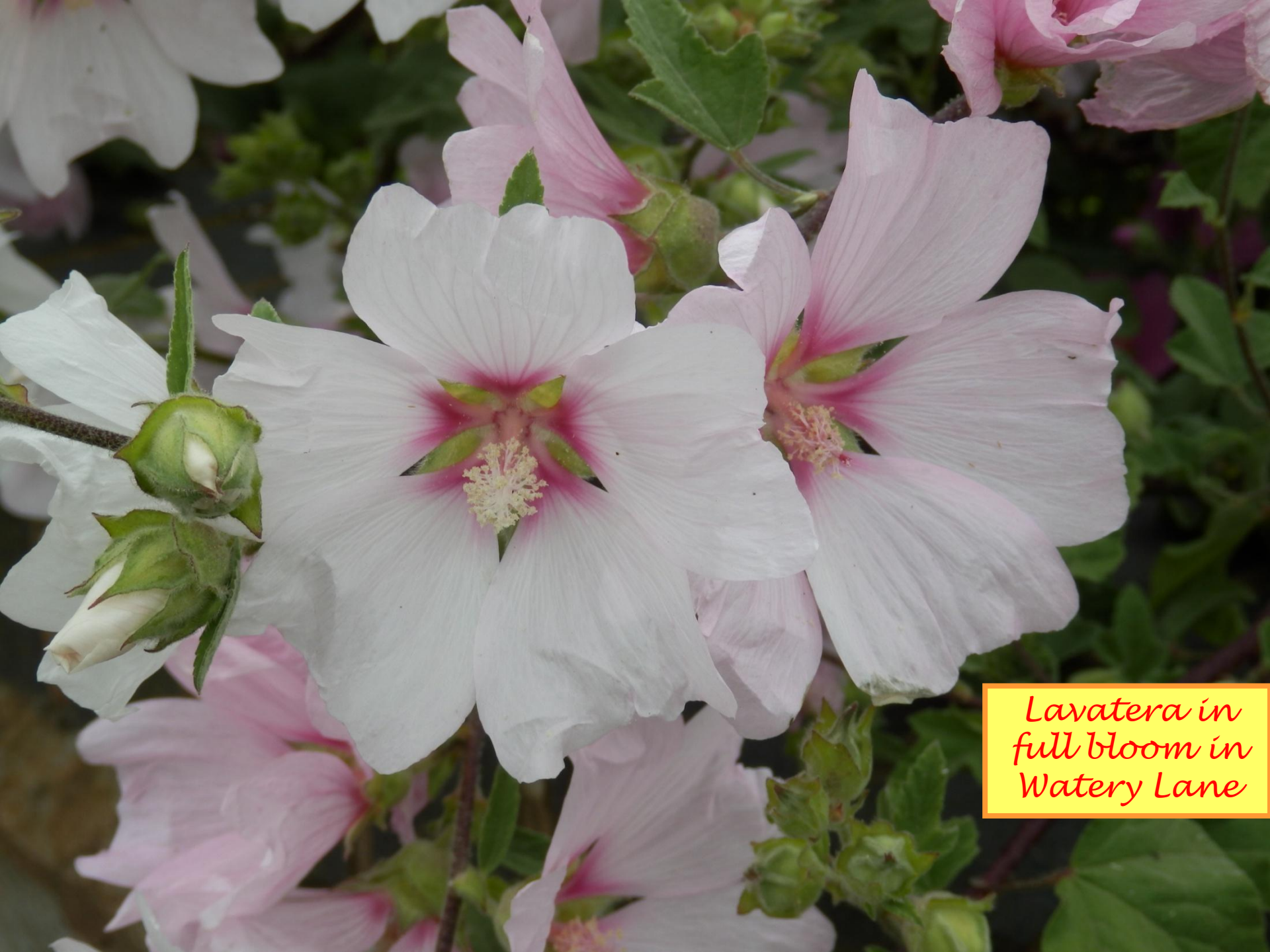
Lavatera in full bloom in Watery Lane