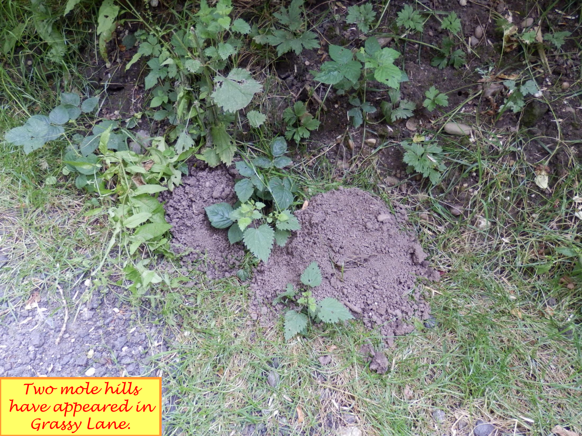
Two mole hills have appeared in Grassy Lane.