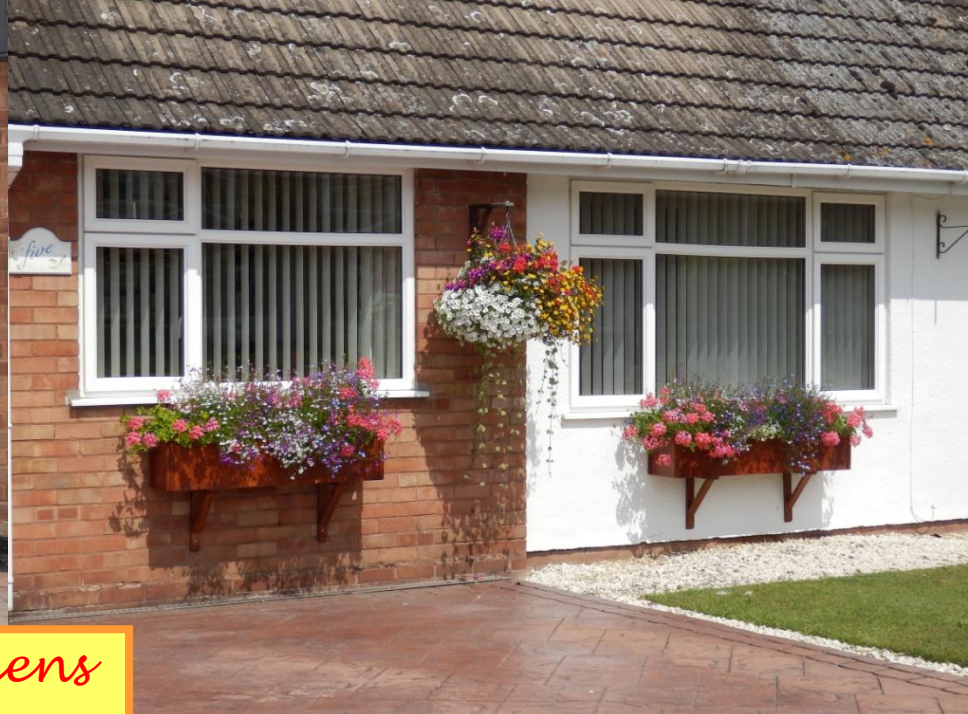
More colourful private gardens