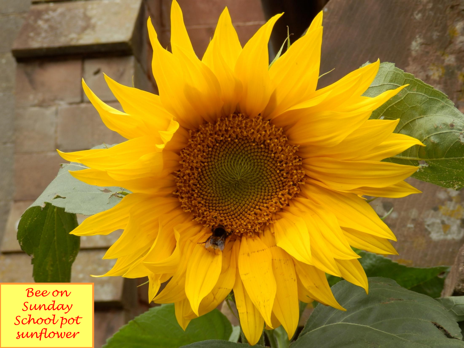
Bee on Sunday School pot sunflower